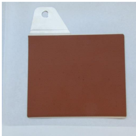
PBE electrode for Ni-Cd batteries