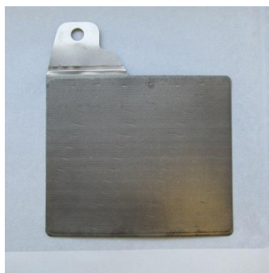
Sintered Electrode for Ni-Cd batteries