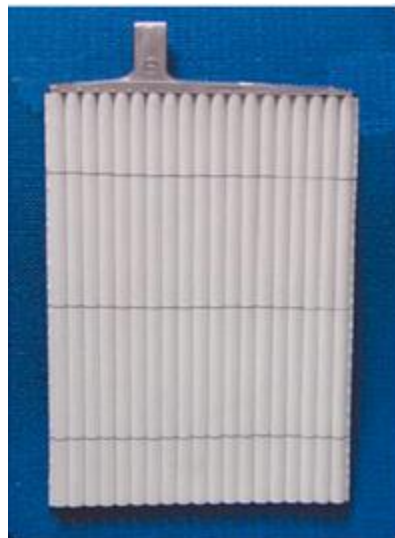
Lead-acid tubular plates